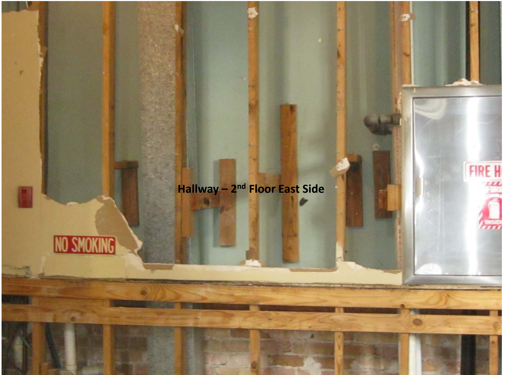
Hallway - 2 nd Floor East Side