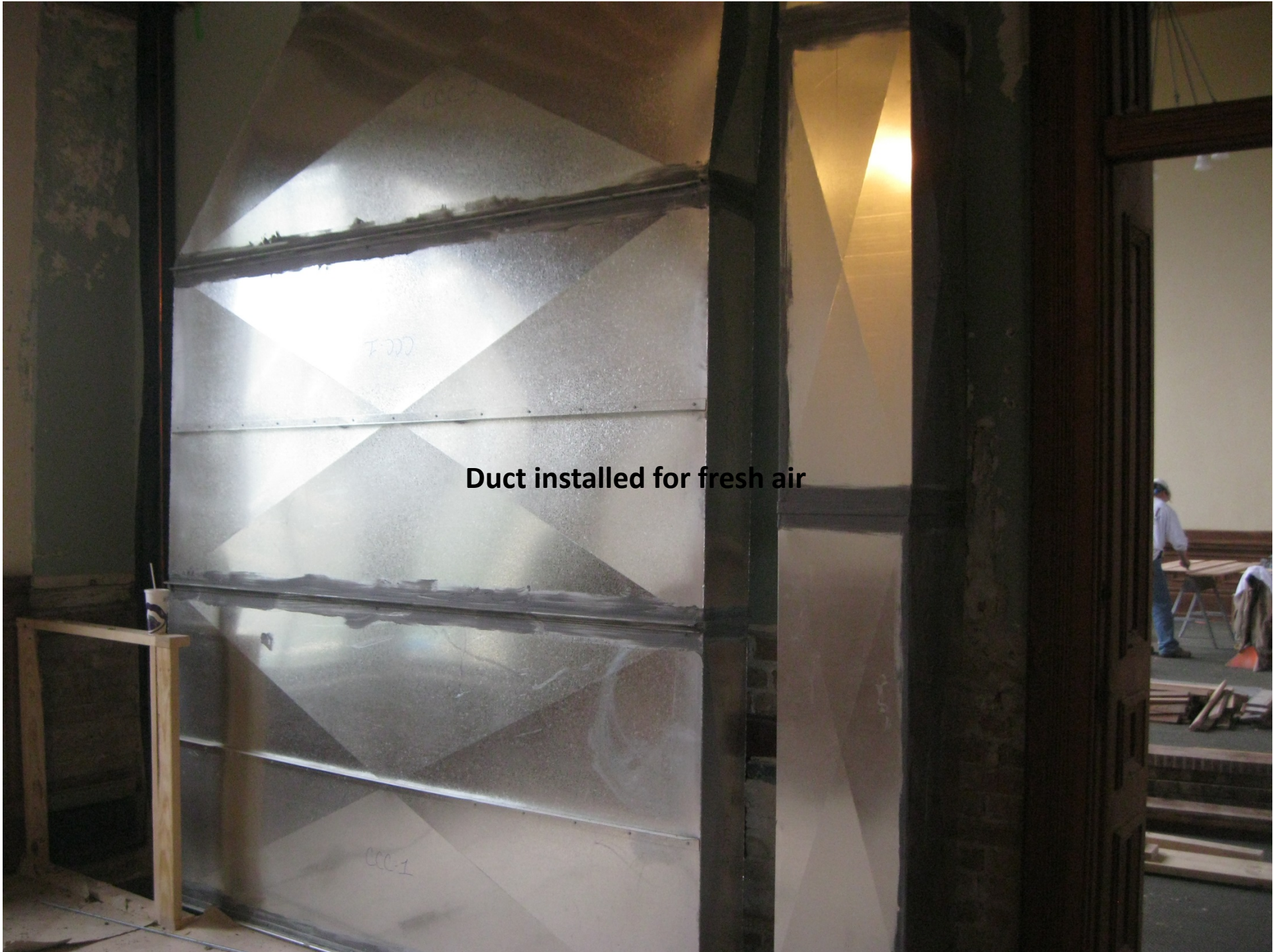
Duct installed for fresh air