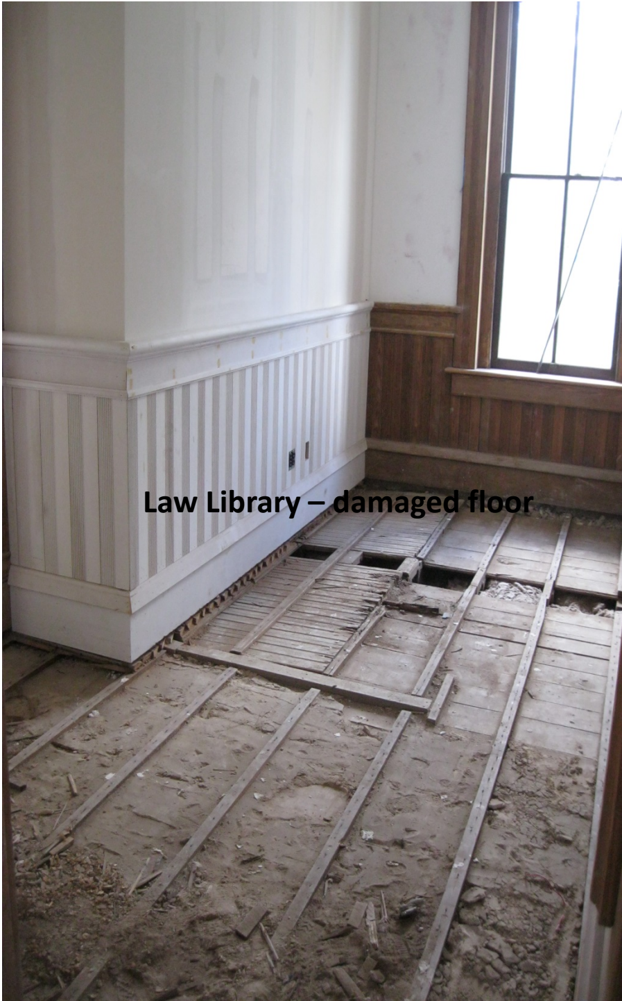
Law Library – damaged floor