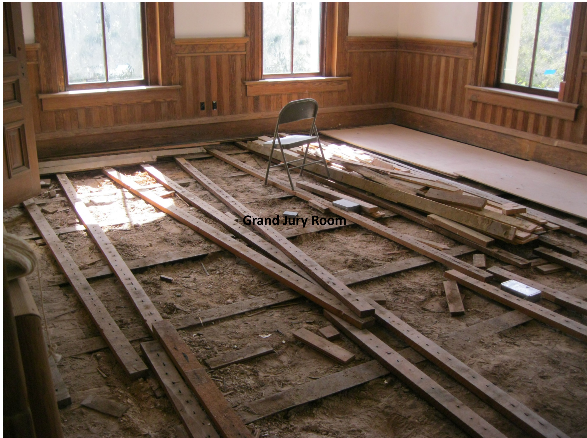
Grand Jury Room