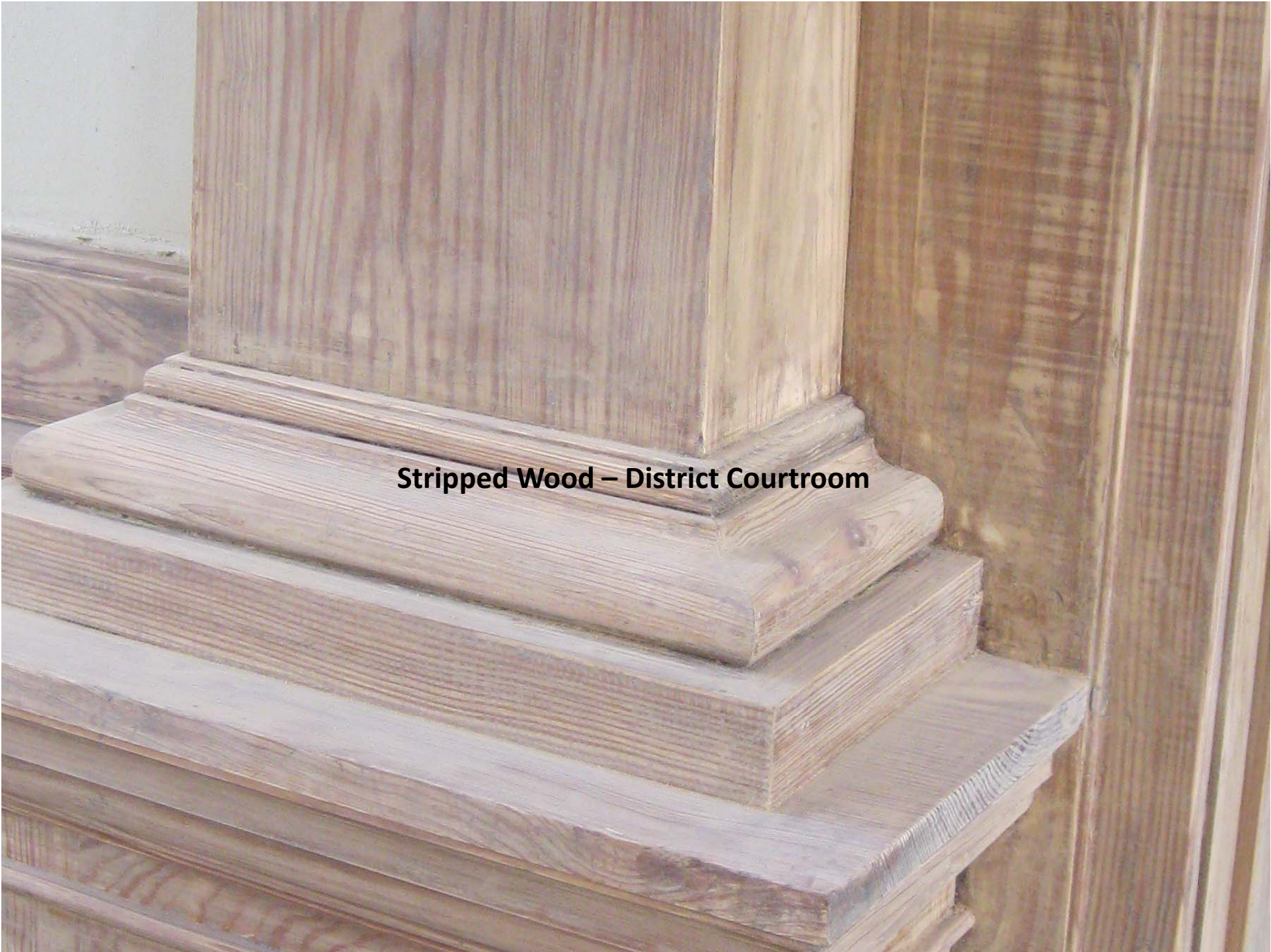
Stripped Wood – District Courtroom