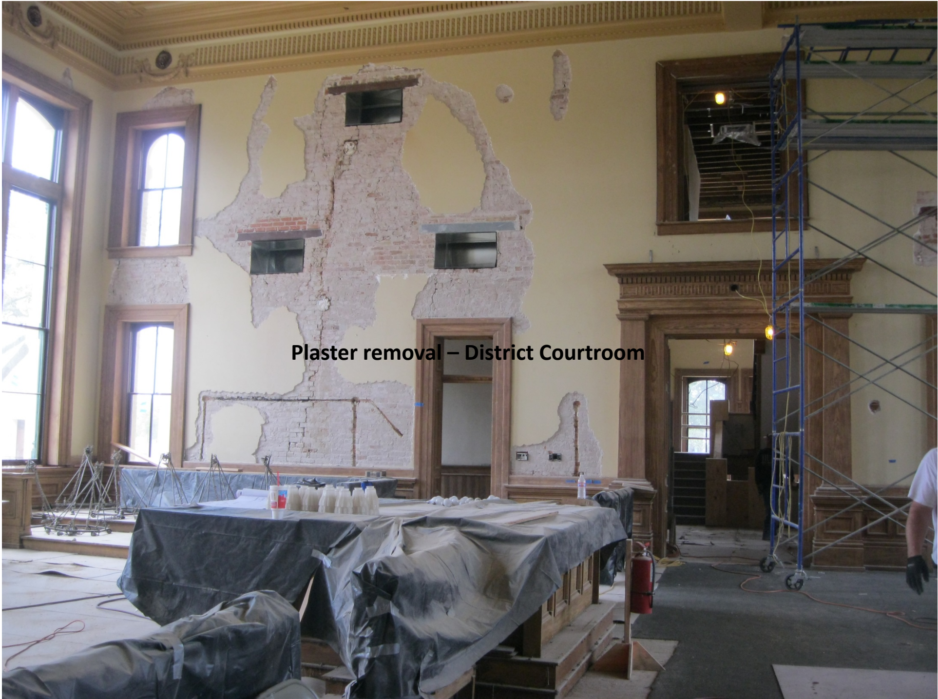
Plaster removal – District Courtroom