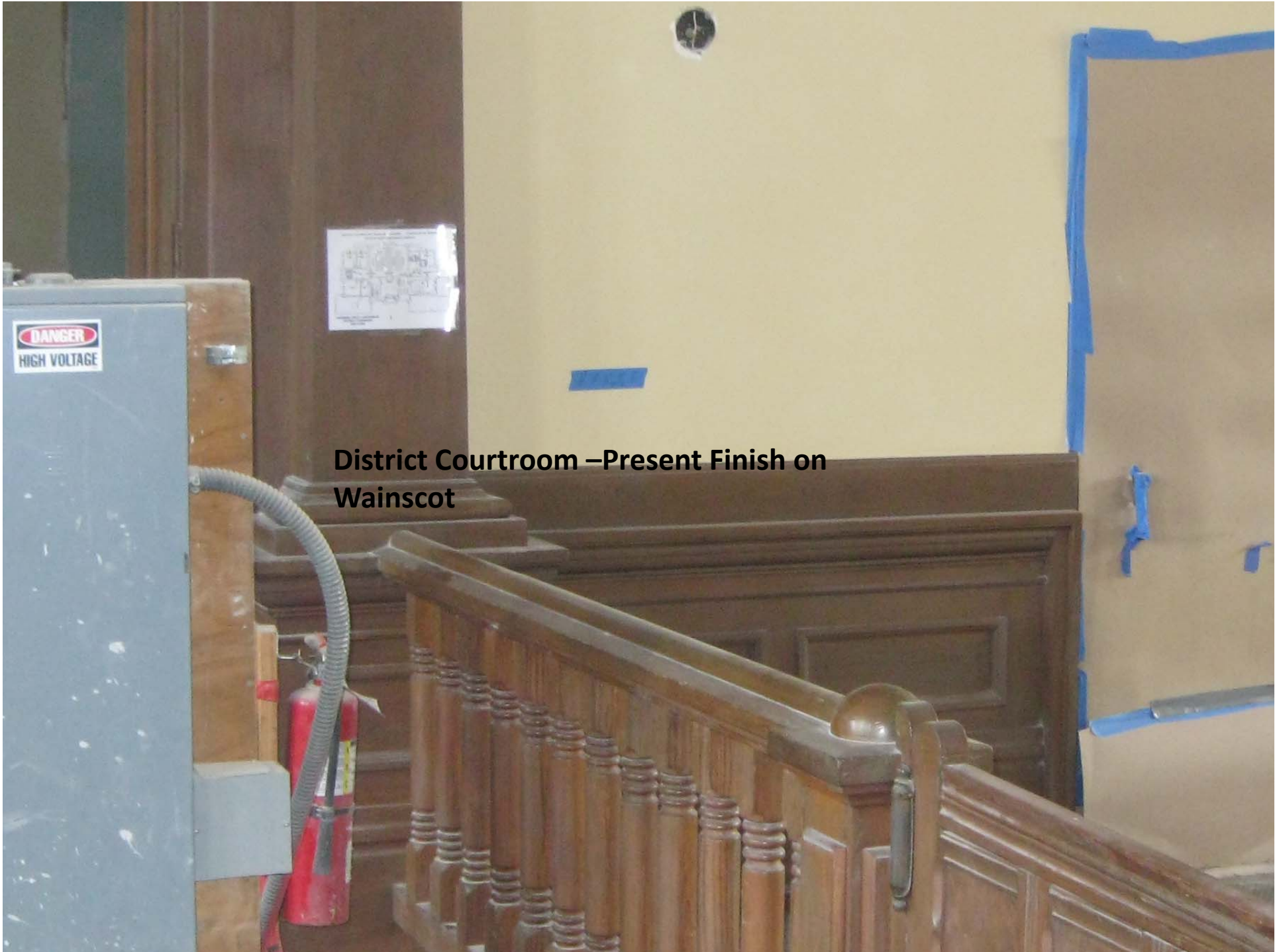
District Courtroom –Present Finish on Wainscot