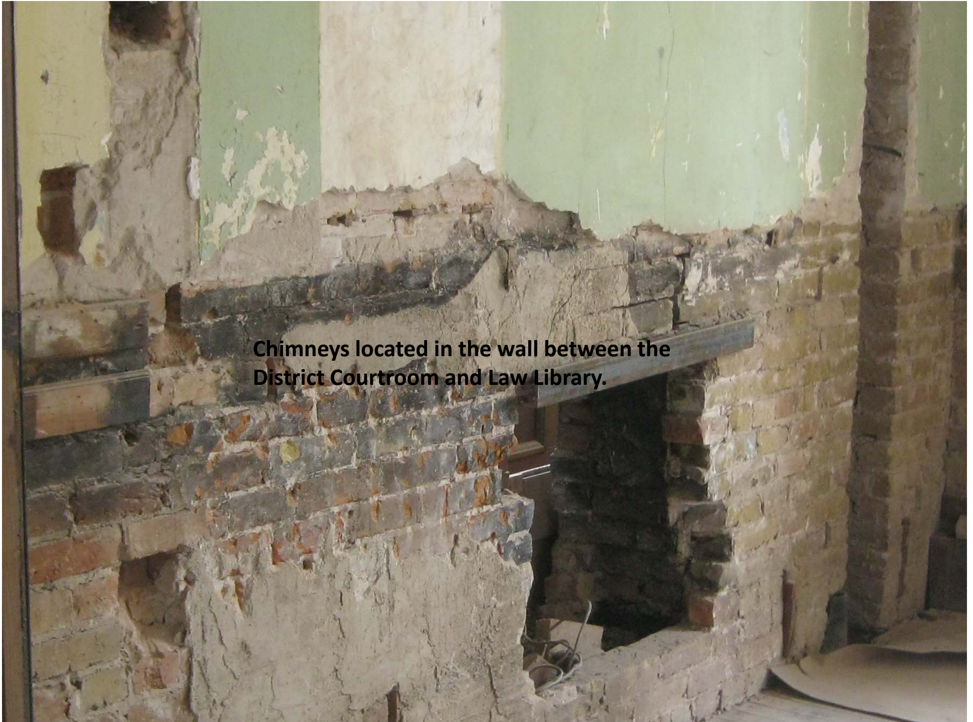
Chimneys located in the wall between the District Courtroom and Law Library.